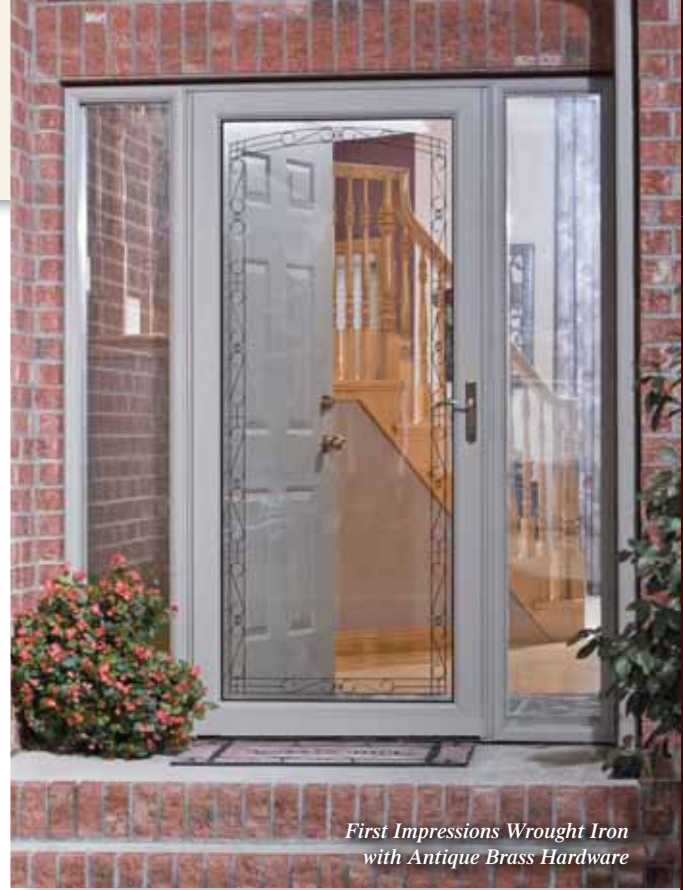
First Impressions Wrought Iron with Antique Brass Hardware