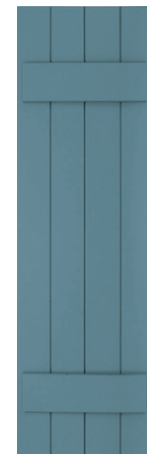
Board and Batten