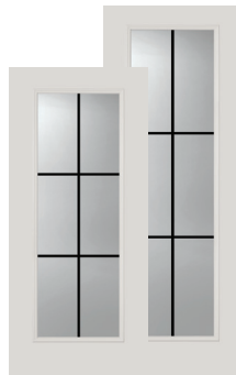
686-IM 8-686-IM 6-Light 6-Light