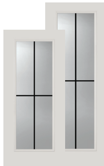
686-IM 8-686-IM 4-Light 4-Light