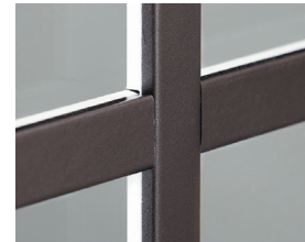
Two-Tone Bronze (exterior) White (interior) GBG