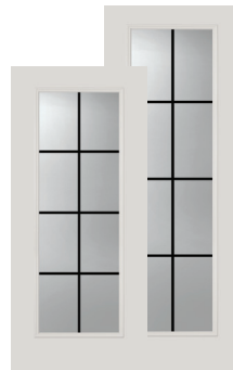
686-IM 8-686-IM 8-Light 8-Light