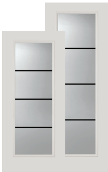
686-IM 8-686-IM 4-Light 4-Light Horizontal Horizontal