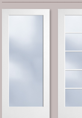
PR-1501 PR-1501S Full Light