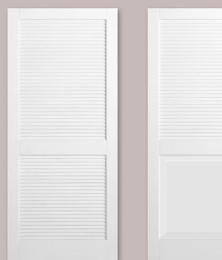
PR-730 Open Louver