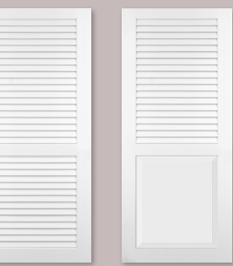
PR-730-PL Open Louver