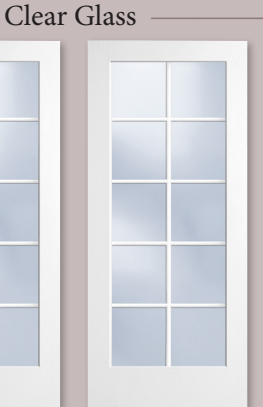
PR-1510 10-Light Ovolo only