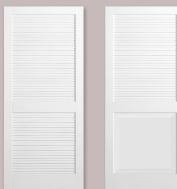
PR-730 Open Louver