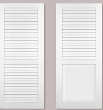
PR-730-PL Open Louver