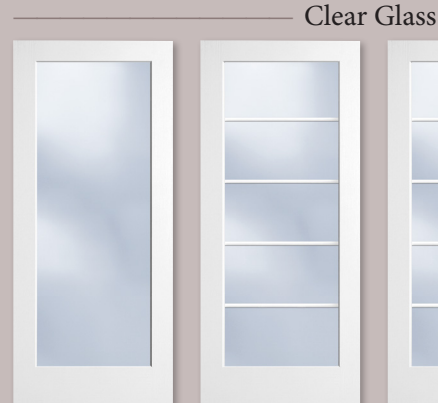
PR-1501 PR-1501S Full Light